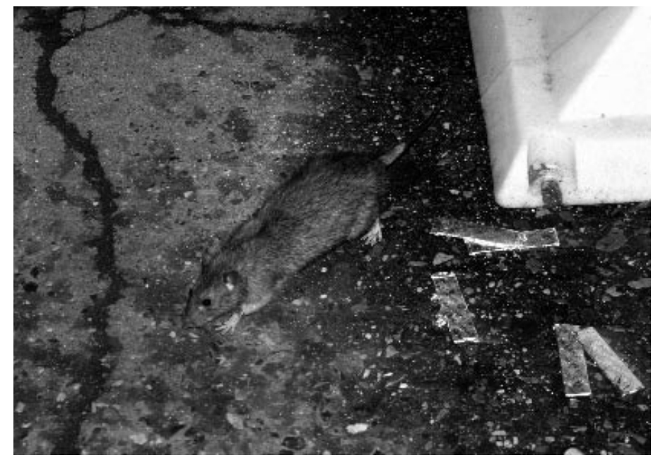
Sanitation is key to successful rodent management.

The rats that are plaguing the District and other cities are primarily the Norway rats. Weighing on average 12 to 16 ounces, these rats are about 16 inches in length. Because these rats are originally from the area along the border between Russia and Iran, they are ground-dwelling mammals that dig and construct nests within earthen burrows. Reproductive peaks for the Norway rat occur in the spring and fall. In ideal conditions, such as a rat colony living in a poorly maintained restaurant, breeding may occur for as long as an entire year. The gestation period for a rat is 22 days averaging liters of 8-12 pups. A female rat is able to produce 4 to 7 liters and ultimately wean 20 or more pups, provided she lives for a year or more. Their peak time of travel is at dusk and just prior to dawn.